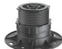
PRO-M SL and PRO L SL

PRO M SL: Self-levelling up to 8% Code: EPROMSL Size: 55mm - 84mm