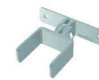
90° EVO joint

Freely rotating joint. Form vertical to horizontal junctions