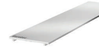
EVO Slim Connector

Code: EVOCON40 Size: 24mm x 50mm x 200mm