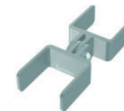
180° EVO joint

Code: EVOSLIMCON Size: 4mm x 48mm x 200mm