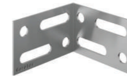
EVO Corner Connector