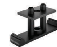
Twin system clip

Code: ESCR46 Size: 5.5 x 46mm (200 pieces) (no bit)