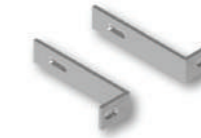
EVO Wall Connector