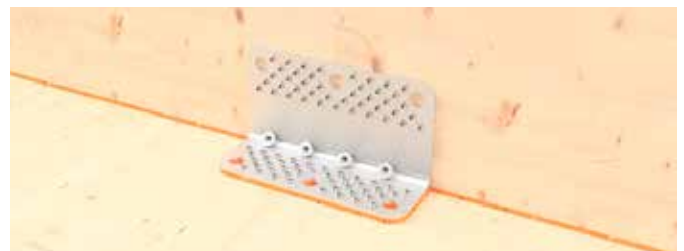
Application with Angle-bracket screw, KonstruX