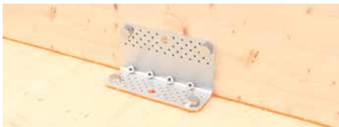
Application with IdeeFix, Metric bolt, KonstruX